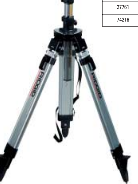
Aluminium tripods, light, easy to erect and transportable. All tripods are equipped with a 5/8" threaded stud, and ground pins for outside work.